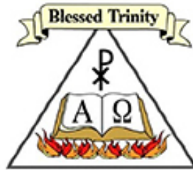
THE BLESSED TRINITY